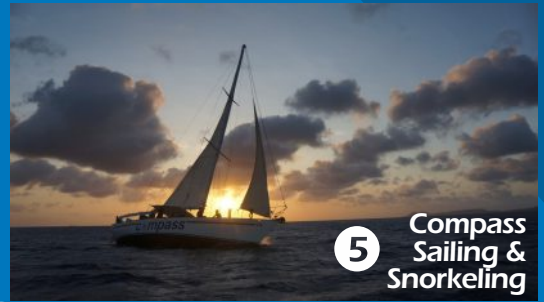
5 Compass Sailing & Snorkeling