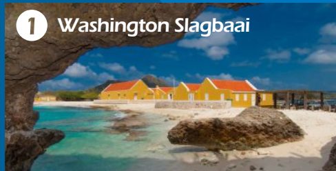
1 Washington Slagbaai