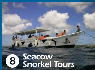
8 Seacow Snorkel Tours